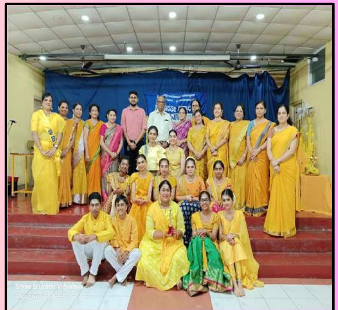
Chalukya Team, The Runners Up