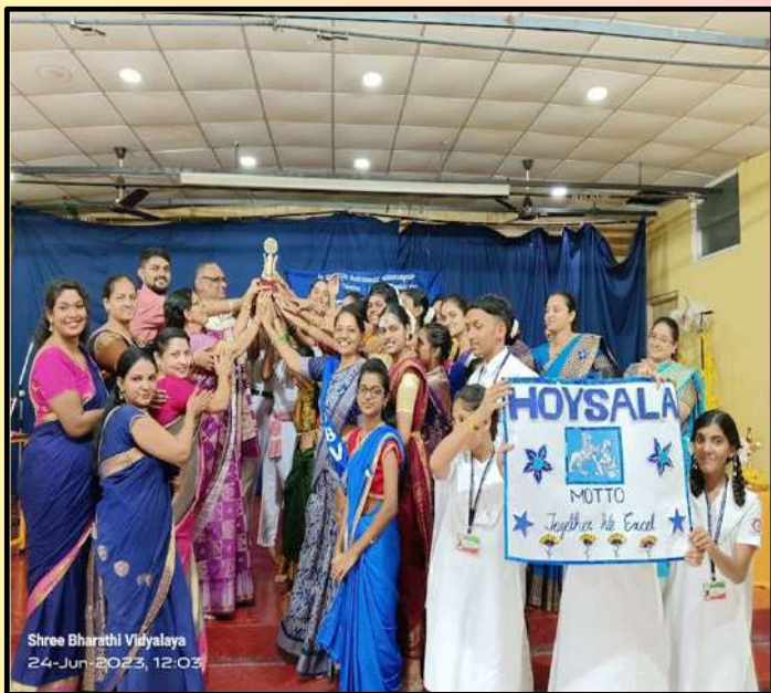
Hoysala Team, The Winners