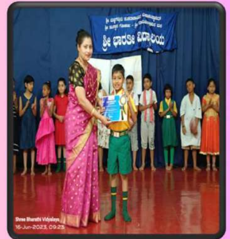
Abhiram-3B-III prize in Decathlon Skating Competition