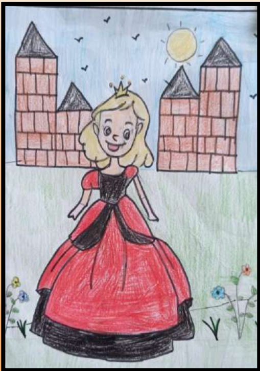
Saanvi Shivanand Naik 2C