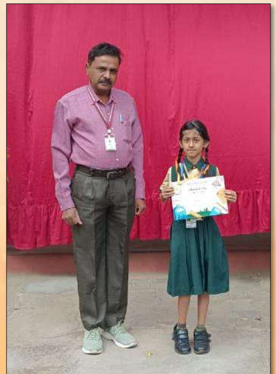
Gaana B R - 2 B

Successfully completed level 1 in SIP Abacus.