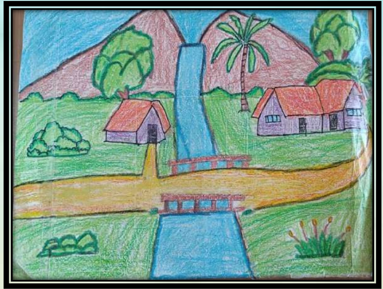
Chaarvi P Naik 3A