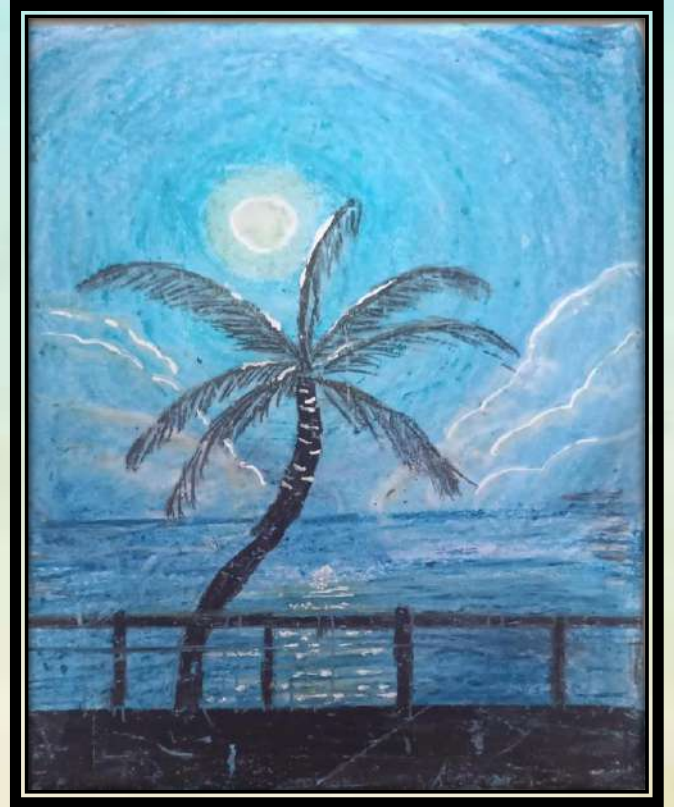
Shreya S 5A