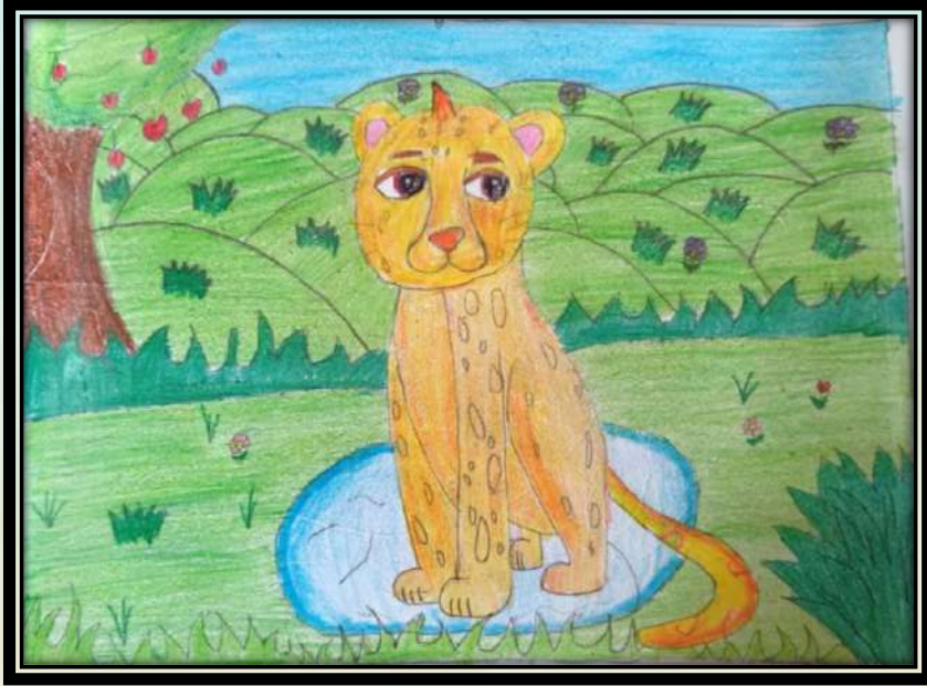
Smahi B 3A