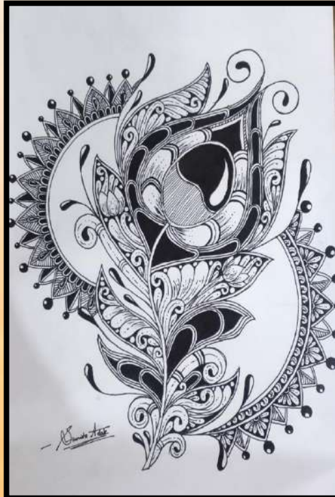
Sunita Adak 9C