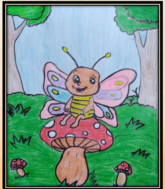
Hasini B G 6B