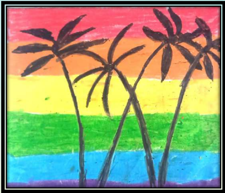
Aradhya A 5C